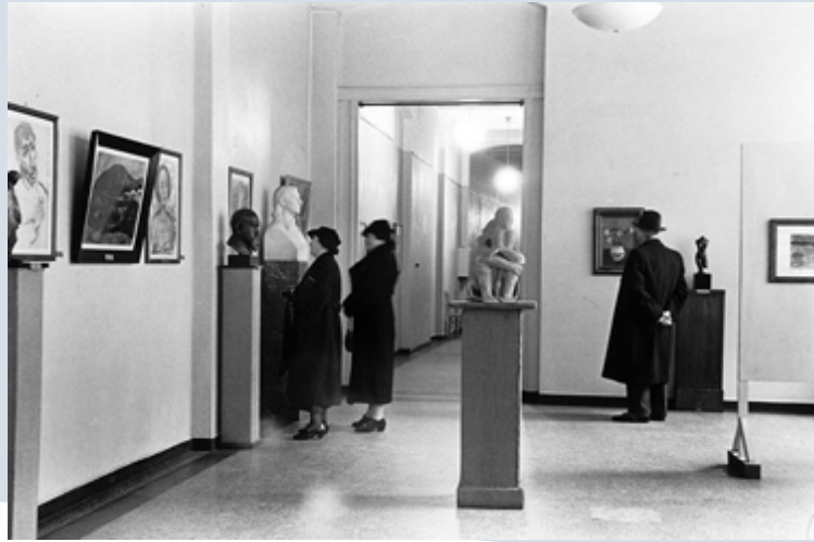
Figure 2. Visitors at the Jewish Museum Berlin, September 1936.

10 Karl Schwarz, "Berliner Jüdisches Museum (Aus den Memoiren von Karl Schwarz)," Robert Weltsch Col., LBINY AR 7185, Box 10, Folder 15, p. 21.