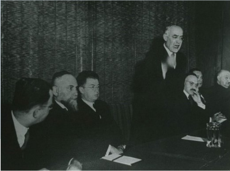
Figure 5. Leo Baeck, President of the Reich Association of German Jews, during a meeting of the executive committee, 1934.

German Jewry, Berlin rabbi Leo Baeck, became its president and therefore was now also the foremost political figure among Germany's Jews.