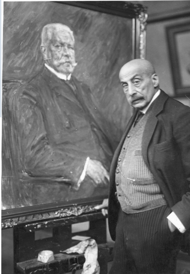
Figure 3. Max Liebermann in his studio with a portrait painting of Reich President Paul von Hindenburg, c. 1927.